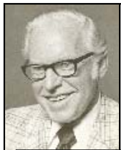
May 30, 1924– Aug. 23, 2009

The City of El Centro and the El Centro Rotary Club said goodbye to one of "the truly good guys" on Saturday, August 29, 2009.