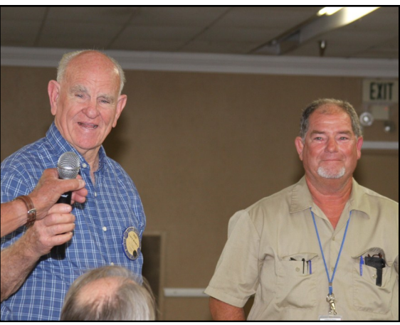
election to the IID Board.

The club gave a warm welcome to all of our visitors.